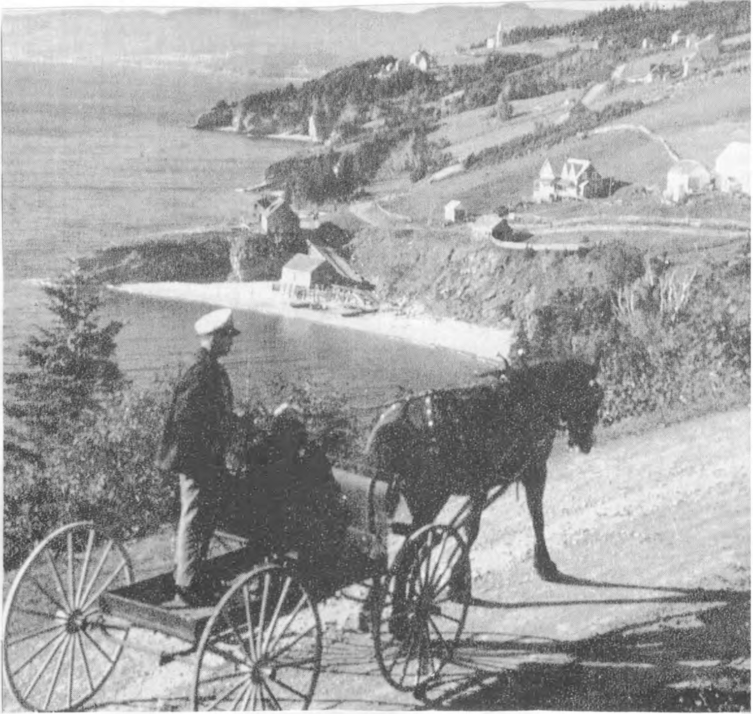
TYPICAL SCENE ALONG THE RUGGED FORILLON SHORE WITH ITS SUCCESSION OF COVES. THE AREA IS NOW WITHIN THE FORILLON PARK.